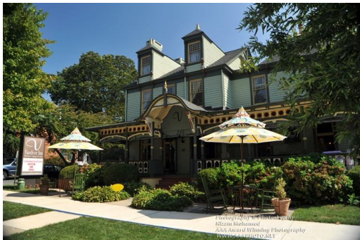
Both weekends are hosted by the Presbyterian Expression of M.E